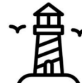
Bird watching tower