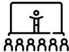
Events & Multi spaces