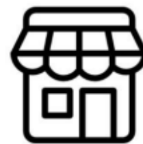
Community market /Pop up store