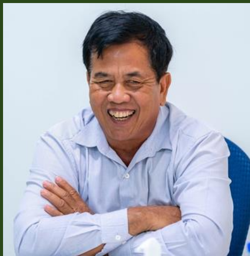
H.E NEAK NERON Deputy Siem Reap Govenor