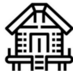
Private resort area