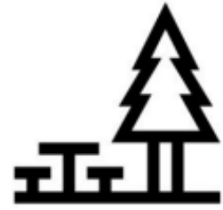
Resting area & Toilet